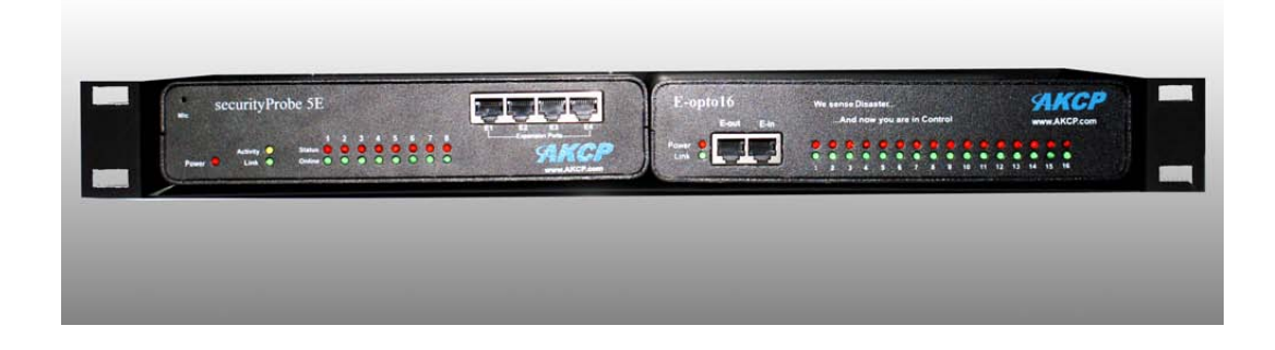
Example concept mounting AKCP devices and sensors using the rack mount kit system