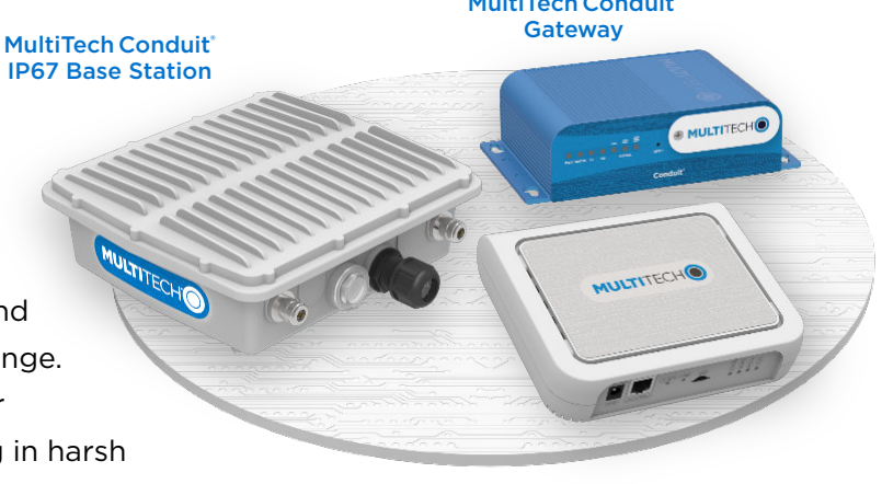
MultiTech Conduit® AP Access Point