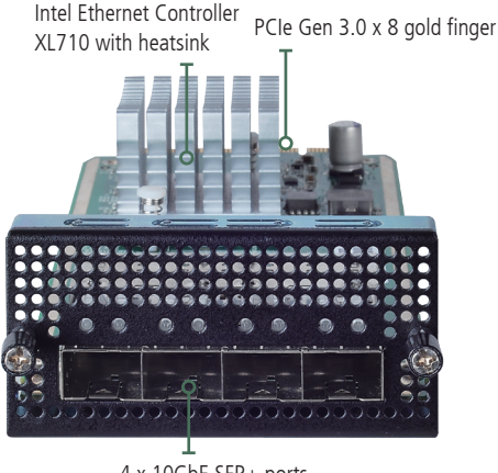
4 x 10GbE SFP+ ports