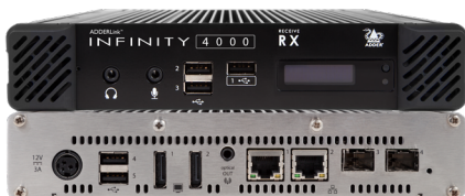
ALIF4021 RX - Front & Rear