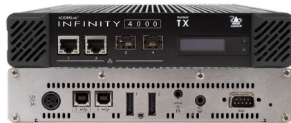
ALIF4021 TX - Front & Rear