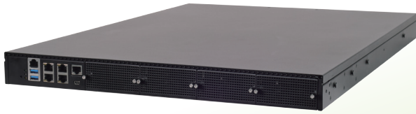
Images are for reference only. See ordering information for SKU details.

1U 19" Rackmount Network Appliance Built with 2nd Gen Intel® Xeon® Processor Scalable Family (Cascade Lake SP/Skylake SP)