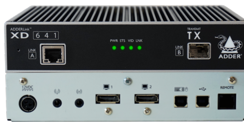
ADDERLink XD641 TX - Front & Rear