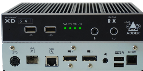
ADDERLink XD641 RX - Front & Rear

CAT6 is recommended for CATx extensions. CATx extensions are limited to 2 patch connections. Patch cables should be CAT6 or better.