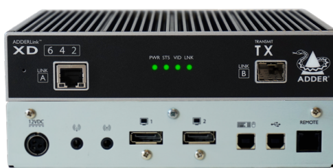
ADDERLink XD642 TX - Front & Rear