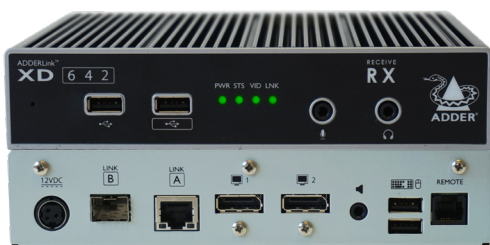
ADDERLink XD642 RX - Front & Rear

CAT6 is recommended for CATx extensions. CATx extensions are limited to 2 short patch connections. Patch cables should be CAT6 or better.