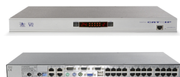
AdderView CATx IP KVM Switch