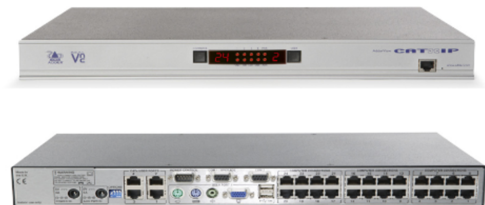
AdderView CATx IP KVM Switch